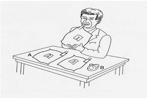
Fig. 2 Triangle Odor Bag Method